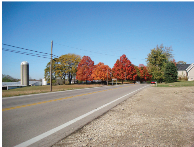
So many things we don't have in Mozambique. Well kept roads, good barns and houses and beautiful tree.