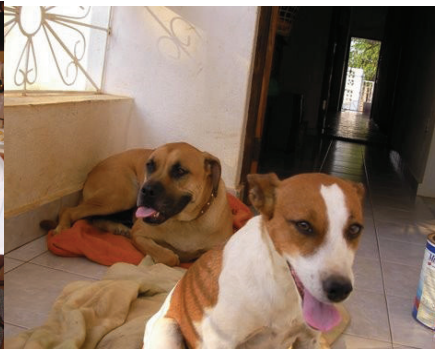
Gidget and Brané patiently waiting for our return.