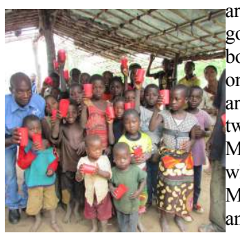
Children enjoying their new cups