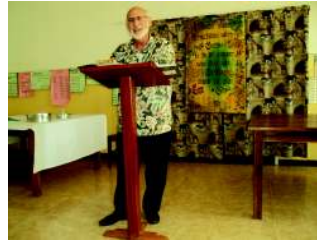
Paul preached and visited some of the rural and city churches