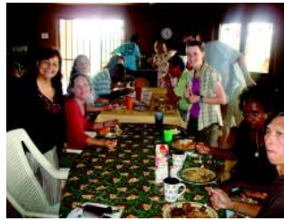
Celebrating Christmas with other missionaries who live in Chimoio.