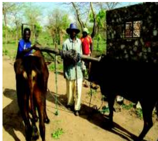
Springtime is right for Plowing