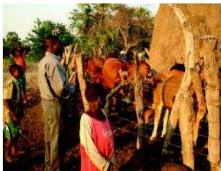
The 7X7 Cattle Project is still growing and blessing.