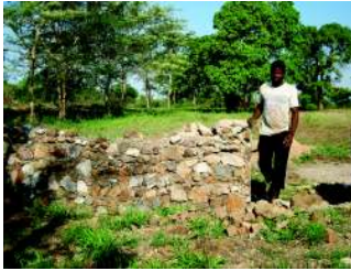
The building for the Grinding Mill has started!