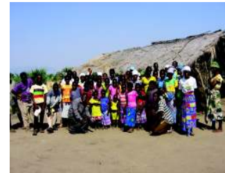
Visiting and Strengthening the Many Churches