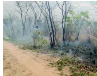
We experienced more "Bush Fires" but were able to protect most of the farm