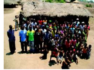
The Church in Tete