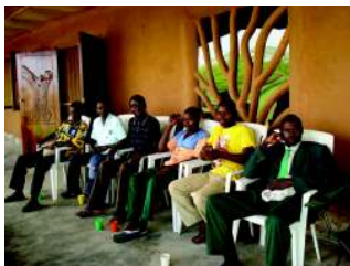
Special day for workers, celebrating the building of our home and watching the Jesus Film in the Sena Language