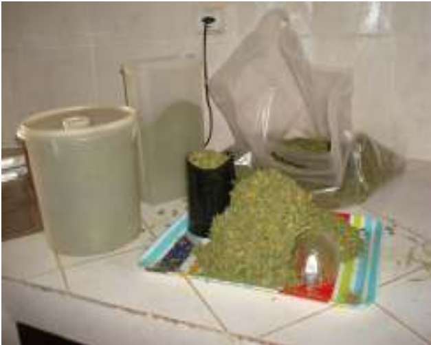
Turning the dried Moringa leaves into powder.