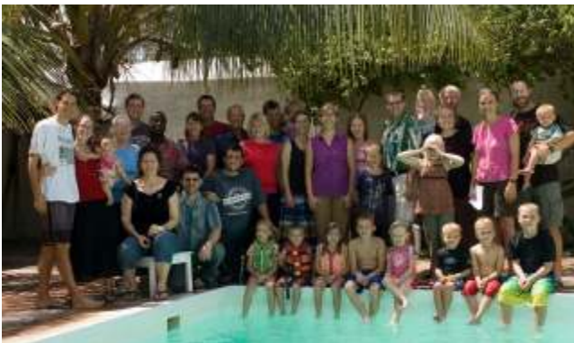
In March we enjoyed our annual Good News for Africa Mission Retreat. This is a picture of most of our teammates.