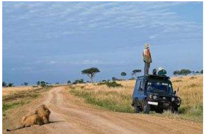
Beware Satan is like a roaring lion seeking to devour us. Thanks you for watching our backs!