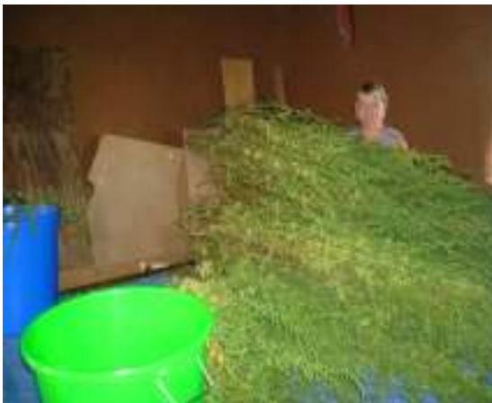
First good crop of Artemisia to help cure malaria